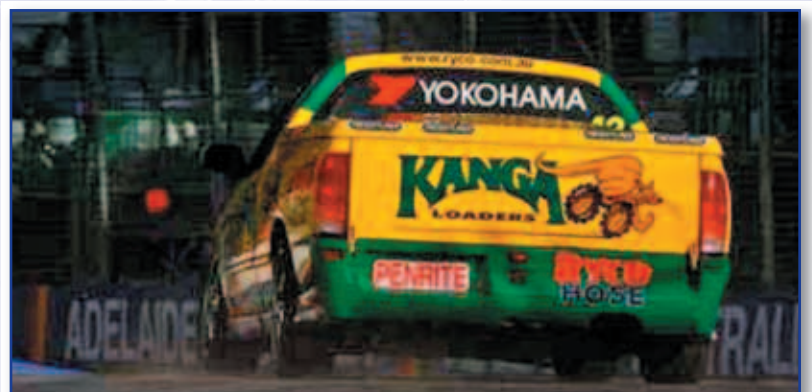
Clipsal 500 Adelaide 2007