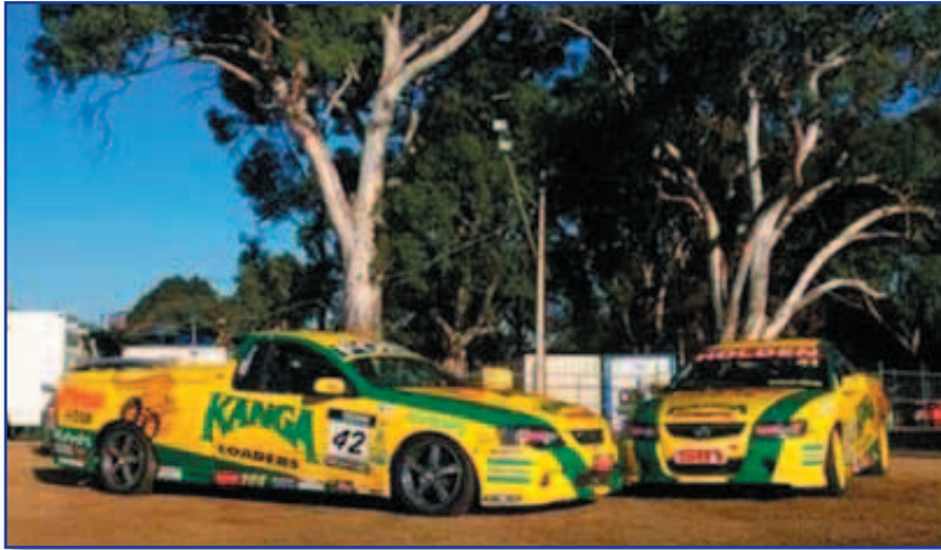
Ready for Racing at Clipsal 500.